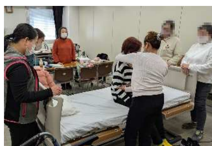
Students working on mastering caregiving skills