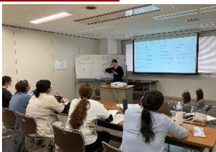
Students learning theoretical knowledge