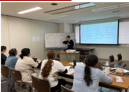
Students learning theoretical knowledge