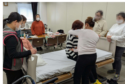
Students working on mastering caregiving skills